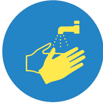
Health & Hygiene